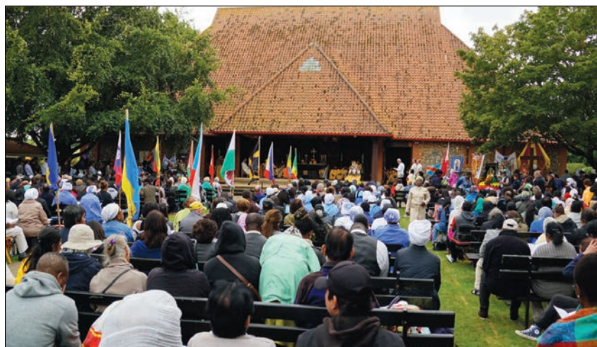
DECEMBER 2015: The Catholic National Shrine of Our Lady of Walsingham is given Minor Basilica status by Pope Francis.