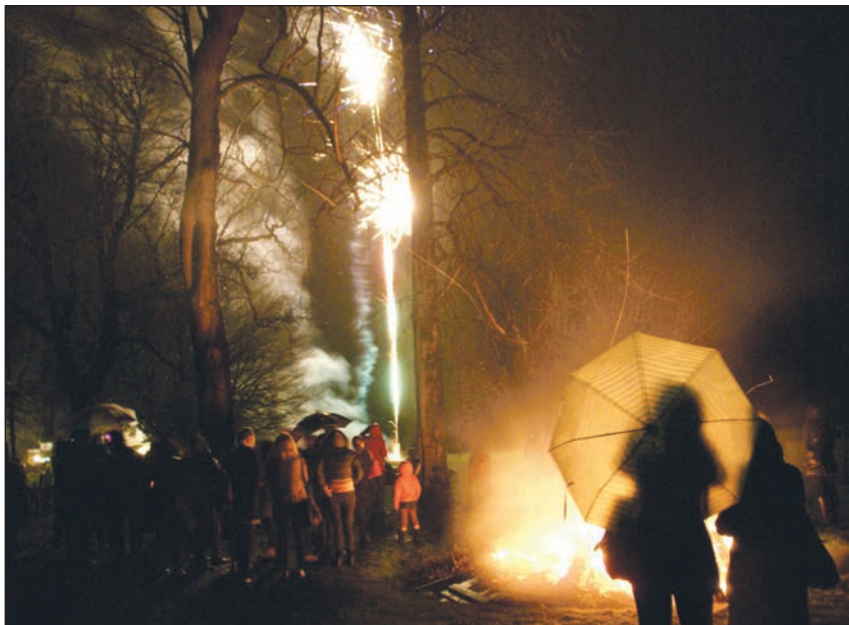
JANUARY: The Epiphany Youth Mass bonfire and fireworks light up skies above Poringland.