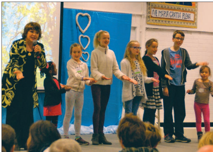
APRIL: Singer and politician, Dana, took part in the Celebrate East Anglia Catholic charismatic weekend in Bury St Edmunds.