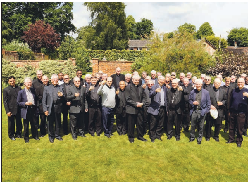
JULY: Four priests with 175 years of service joined 42 others from across the Diocese at a Celebration of Priesthood at the Bishop's White House.