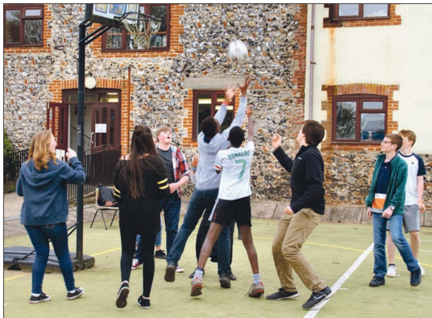
MAY: Basketball was one of the many activities on offer at the Ignite Youth Festival which took place at Sacred Heart School in Swaffham.