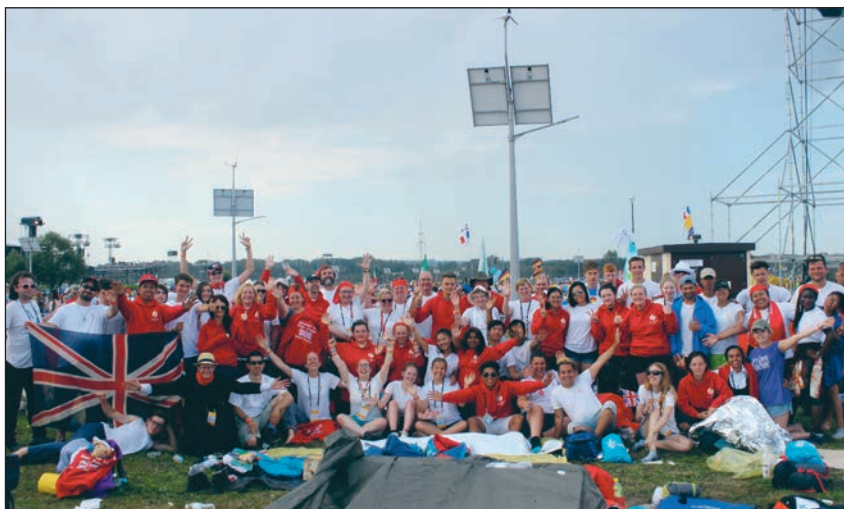
JULY: World Youth Day in Krakow, Poland, saw an 80-strong pilgrim group from the Diocese of East Anglia attend the celebrations.