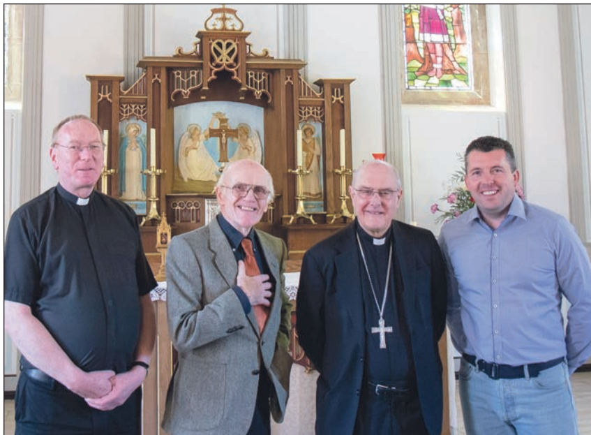
MAY: Hunstanton parish church was transformed with a major refurbishment.