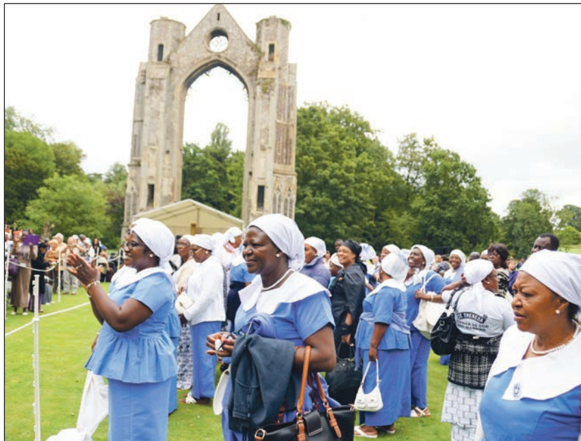
SEPTEMBER: Over 3,500 pilgrims representing the vibrant, multi-cultural Catholic church gathered at the National Shrine of Our Lady at Walsingham for the annual Dowry of Mary Pilgrimage.