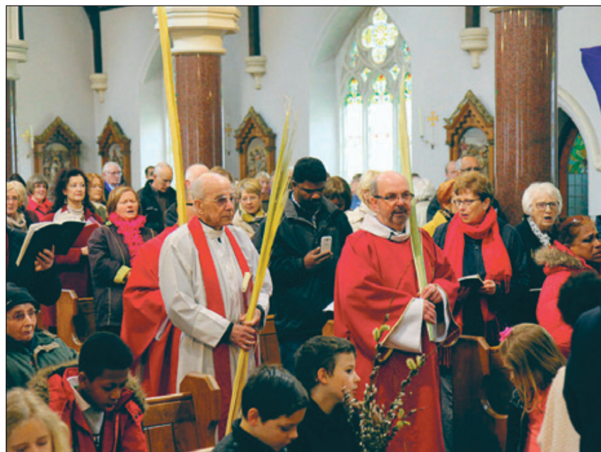
EASTER: Palm Sunday at Our Lady of the Sea in Lowestoft.