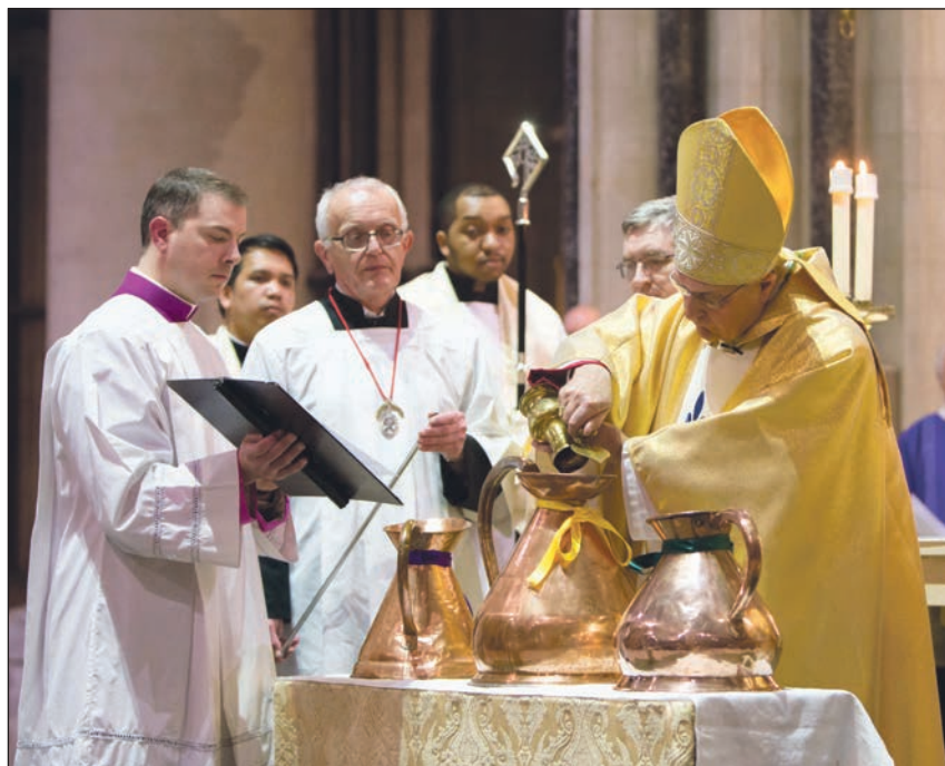
MARCH: The special Chrism Mass at St John the Baptist Cathedral.