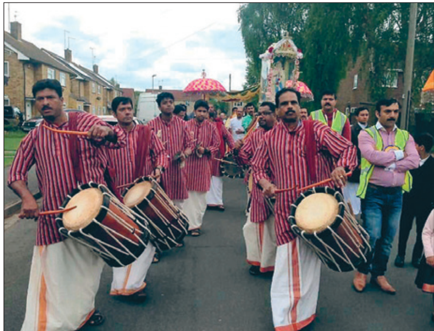
MAY: 500 members of the Syro-Malabar community process through Peterborough to mark the start of the Marian month.