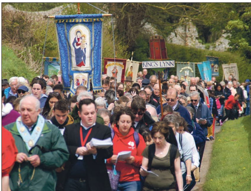
MAY: The diocesan annual pilgrimage to Walsingham helps to mark the 40th anniversary of the Diocese.