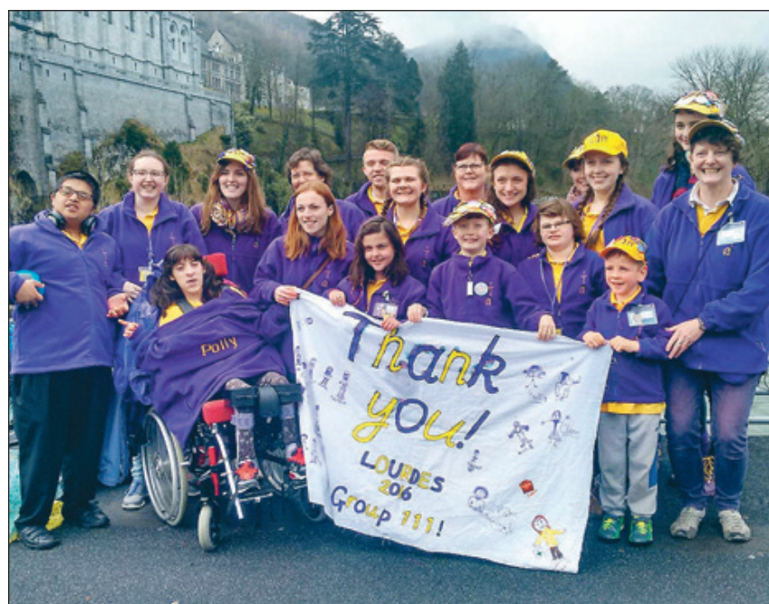
EASTER: HCPT East Anglia children's pilgrimage to Lourdes during Easter week.