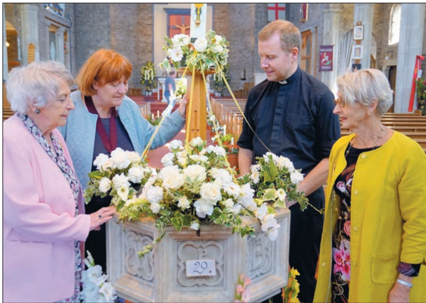
SEPTEMBER: St George's in Norwich celebrated its 50th anniversary with a three-day flower festival and art exhibition in which parishes from across the Diocese were invited to contribute displays alongside other local churches.