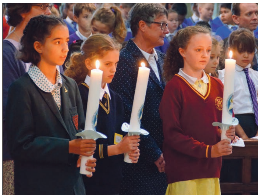
SEPTEMBER: 700 pupils and staff gathered at the Schools Mass at the Cathedral of St John the Baptist in Norwich to mark the start of the new academic year.