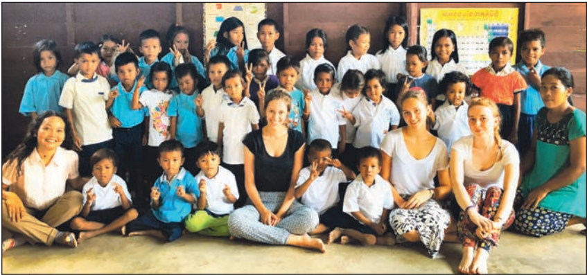
East Anglian visitors join the Peik Snaeg Chas village class in Cambodia.