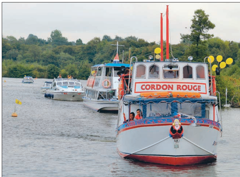
SEPTEMBER: A flotilla of boats took part in the Our Lady of Peñafrancia feast and river procession on the Norfolk Broads.