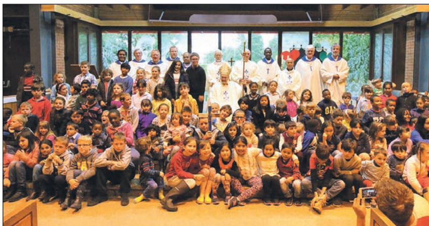
MAY: There was singing in the rain at the Children's Pilgrimage to Walsingham but the event carried on indoors, including a mobile Holy Door.