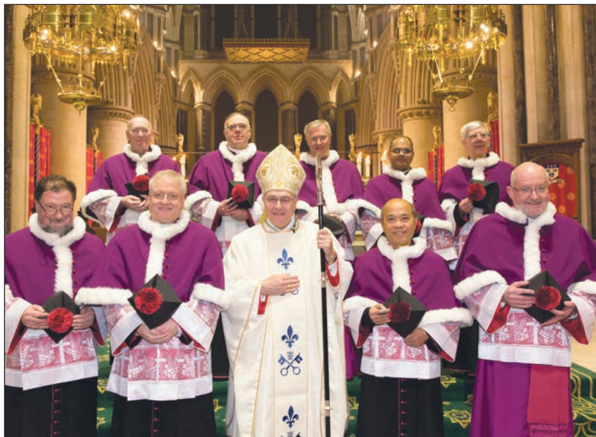
MARCH: The new Cathedral Canons are installed in Norwich.