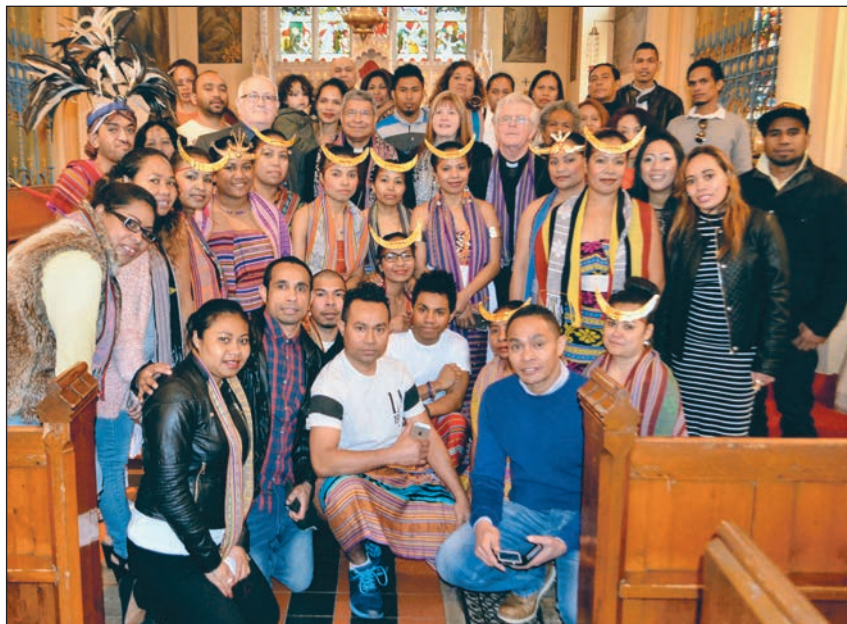
EASTER: Bishop Carlos Belo spent Easter in Great Yarmouth with the East Timorese community.