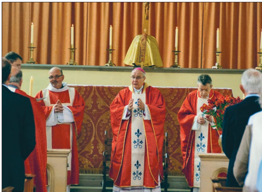
JUNE: The Church of the Sacred Heart in Southwold celebrated its centenary with a special Mass and Champagne reception.