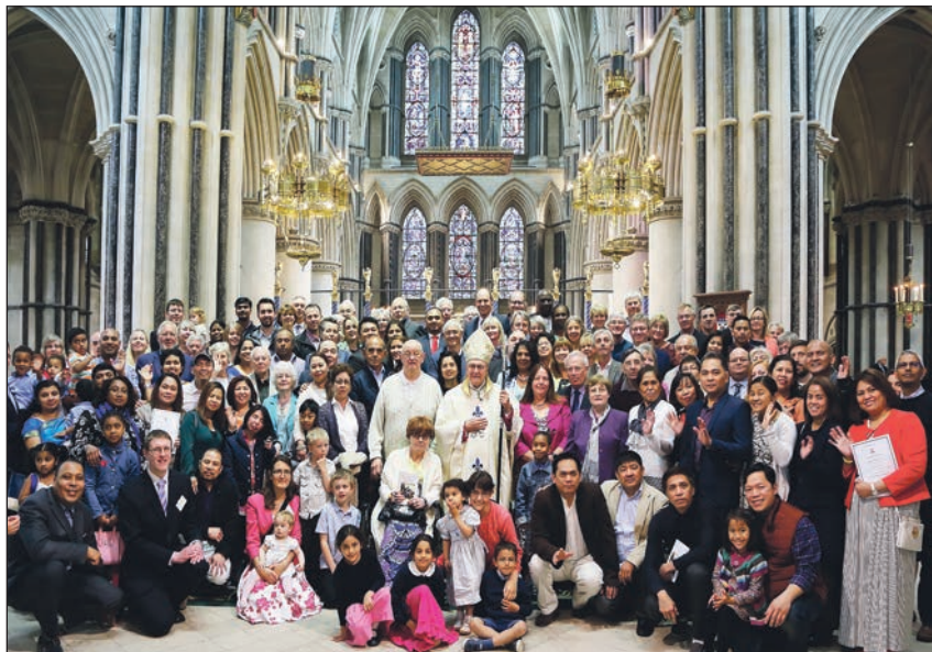
JUNE: 3,400 years of marriage were celebrated at the annual Marriage and Family Celebration Mass in Norwich.