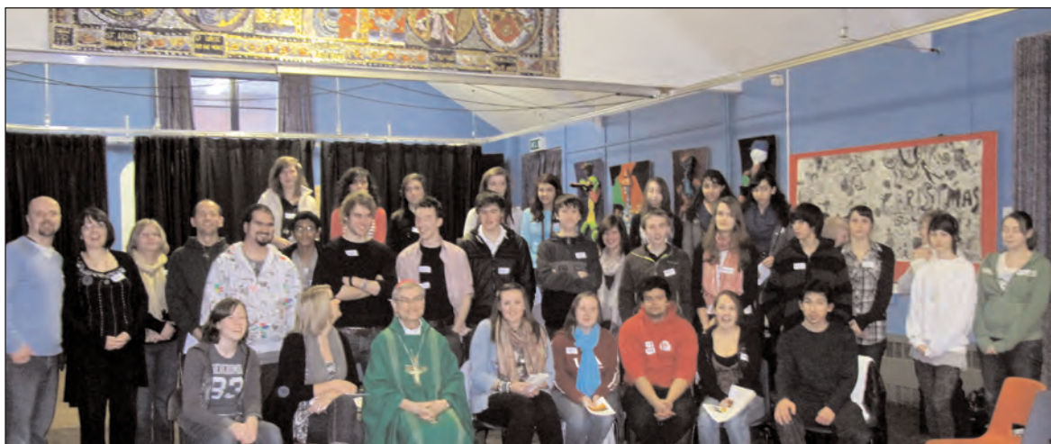
Some of the young people preparing for the World Youth Day at Bury St Edmunds and below left a snow scene at Poringland

(To download a booking form, go to www.catholiceastanglia.org.uk/youth and download 'WYD Information Pack 1')