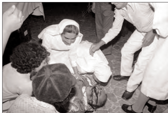
Romero’s body immediately after his murder

At around 6.30 p.m. on 24 th March 1980, Archbishop Oscar Romero of San Salvador was celebrating Mass in the chapel of the cancer hospital where he lived. As he finished his homily, he was assassinated by a death squad marksman. He was a humble but outspoken prophet of God’s justice for his people, and someone many would now like to be recognised as a saint for the whole Church.