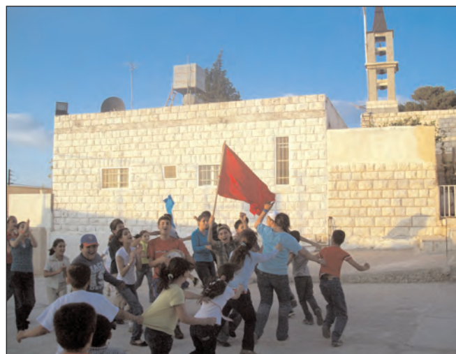
The Parish Centre in Al-Wahadneh