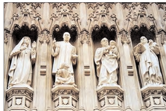
Archbishop Romero is included (2 nd from right) among the modern martyrs at Westminster Abbey

What you do for them, you do to God. The way you look at them is the way you look at God.