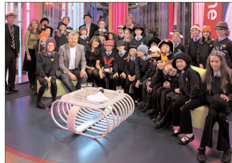
Staff, pupils and parents from St Thomas More Junior School in Norwich appeared on the BBC's One Show and won an award for their imaginative response to the Haiti earthquake disaster.

A session is to be held at Emmanuel College in Cambridge on Friday 12 March and full details are on the website www.csan.org.uk