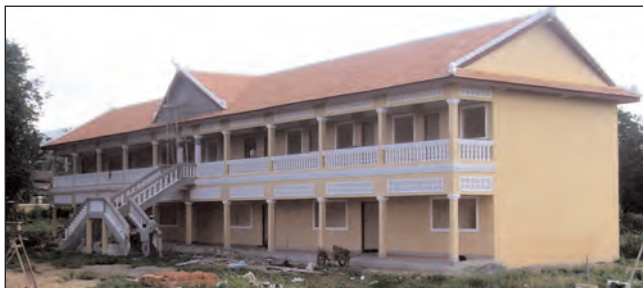
The multi-purpose Pastoral Centre in Pailin, Cambodia, that we have helped to build

All modules are on Saturdays, with registration and coffee at 10.30 and finishing at 3.00. Bring your own packed lunch. Tea and coffee will be provided. Perhaps bring a cushion!