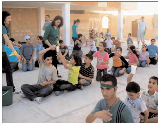
Fun and games in Al-Wahadneh

We also have 9 nuns who were originally from our parish; they are working in the congregation of the Sisters of the Rosary. As you see, every year we sent a new vocation to the Seminary, and our Rosary Sisters help us in our missionary work in Wahadneh.