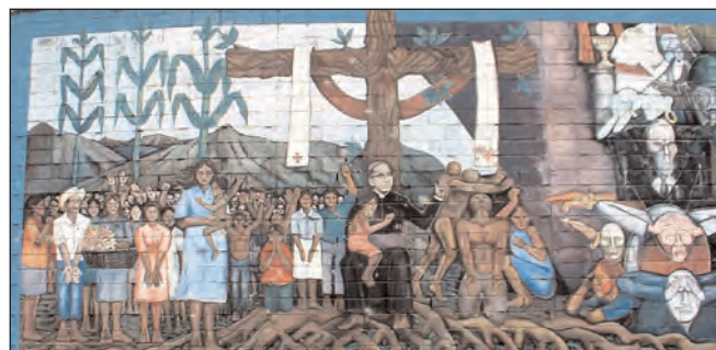
A mural of Romero with God’s crucified people

In 1977, Oscar Romero was appointed Archbishop of San Salvador, the capital. He was a rather quiet and timid man, seen as conservative and ‘safe’ by those in power. But within weeks of his appointment, one of his priests, Fr Rutilio Grande, was ambushed and murdered along with two parishioners. Increasingly from that moment, Romero spoke out against injustice, and taught that the way we treat the poor is the way we treat God! He called for conversion of heart, and for the violence of the oppressors to be defeated by Christian love.