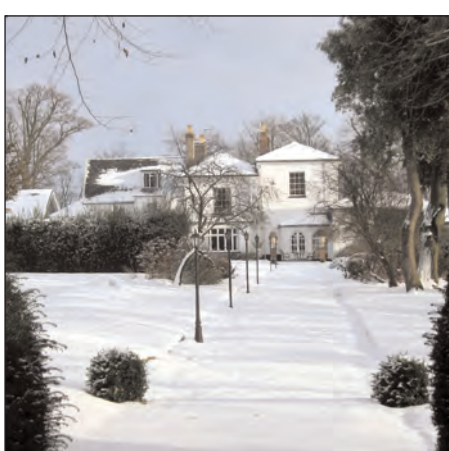
A view of this year's bleak winter at the White House

As it was Epiphany, people were asked to bring wrapped gifts to be put into a lucky dip and given out at the end of Mass to each other. Some people came away with something much better than they had