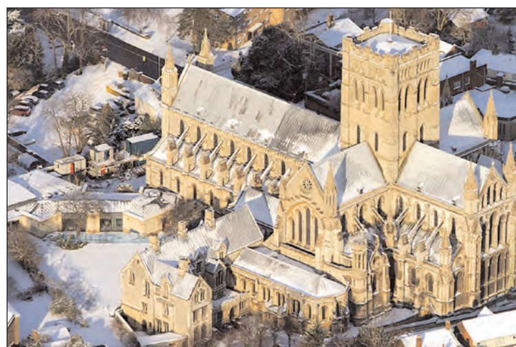
View of the cathedral taken this year by aerial photographer whose work can be seen on www.norfolkskyview.flyer.co.uk