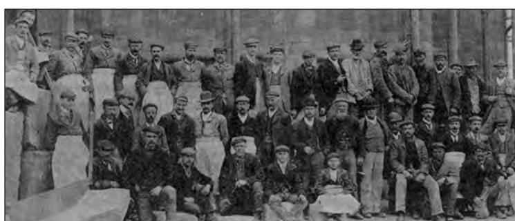
father and grandfather helped to build the church.

Work has started on its installation and it is hoped to be completed in time for the Chrism Mass on the Wednesday of Holy Week.