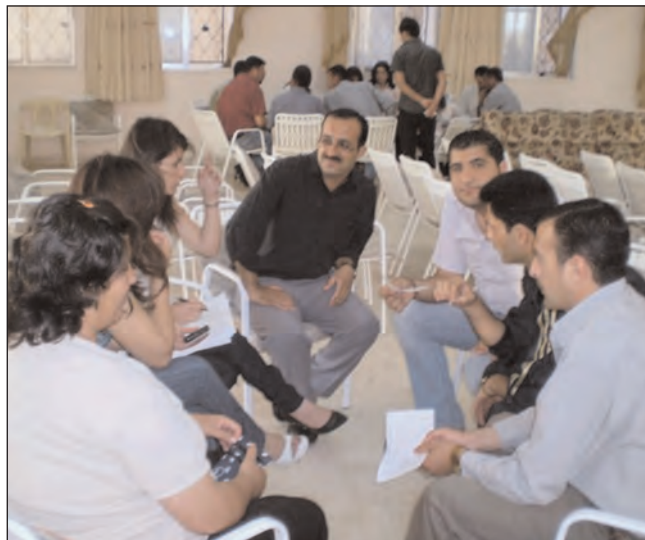
Adults discuss together

There is also a committee of men of the parish who assist with parish affairs in general and a committee of young people who plan spiritual and recreational activities for young people. Finally, every month we have a meeting for all adults where we look at how we can live our lives as Christians.