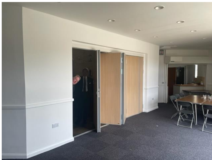
Fr Jeffrey in the new small hall at St Luke's

At a cost of £120,000 the grounds have been fenced off, creating a safe space for outdoor activities, fire exits have been improved, the server's sacristy enlarged, kitchen and toilets replaced, and external storage supplied. In particular, three small rooms have been knocked together to create a useful small hall, which can be opened onto the church. In October, the building work was blessed, the children's choir sang 'Panis Angelicus' by Cesar Frank, and everyone enjoyed a buffet lunch with celebration cakes afterwards.