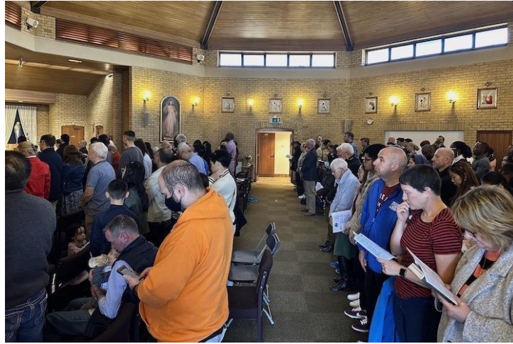
St Luke's growing congregation

Among recent projects, at St Luke's, Peterborough , considerable housing development in the area has led to significant growth in recent years. There are now three Sunday morning Masses instead of one and attendance has more than doubled over the past five years alone. The church community is young and diverse, bringing much new life and freshness to the parish, along with a new voluntary aided primary school, St John Henry Newman.